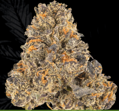
RUNTZ ZKITTLEZ X GELATO