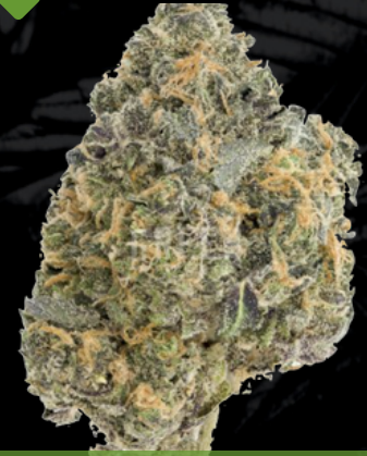
SUNSET OCTANE SUNSET SHERB X HIGH OCTANE OG BX3