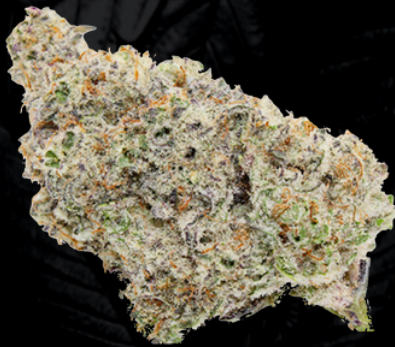
MAC 1 ALIEN COOKIES F2 X MIRACLE 15