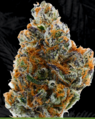
PURPLE APRICOT PURPLE PUNCH X LEGEND ORANGE APRICOT