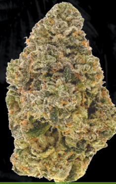
JET FUEL GELATO GELATO 45 X HIGH OCTANE OG X JET FUEL G6