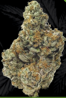
ICE CREAM CAKE WEDDING CAKE X GELATO #33